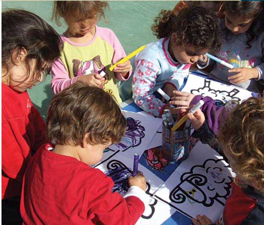
Peace Preschool kids learn about the Muslim celebration of Id el Adha.

Director General Jerusalem International YMCA