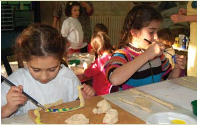
Children learn to express themselves through our new Creative Arts program.